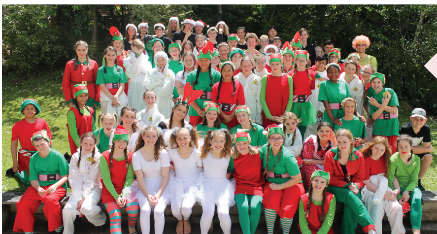
Kavanagh Pantomime 'Grinch-19'