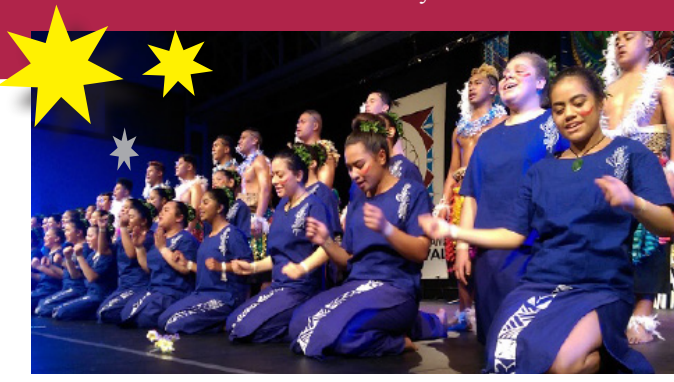
Kavanagh’s Pasifika Vibes performed at the Polyfest at the Edgar Centre in September.