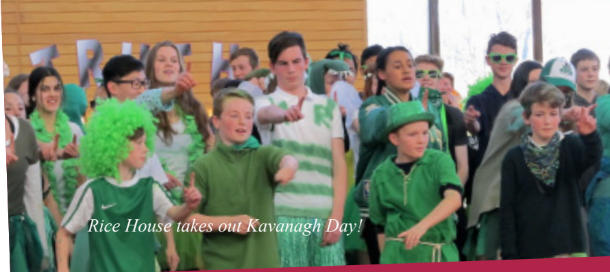
Rice House takes out Kavanagh Day!